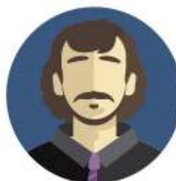
PERRY Planner Mid-40s